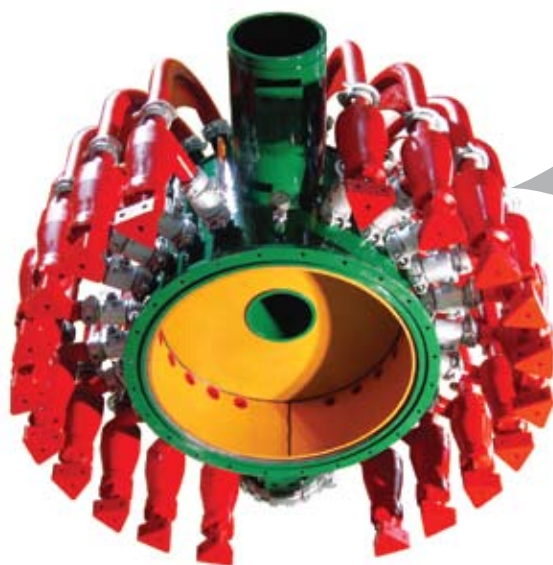
Underside of Round Desilter Manifold