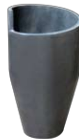
Body Ceramic Liner