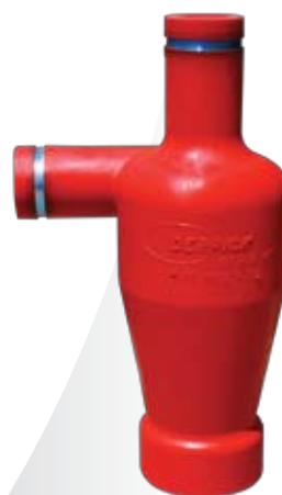
4" Hydrocyclone Body