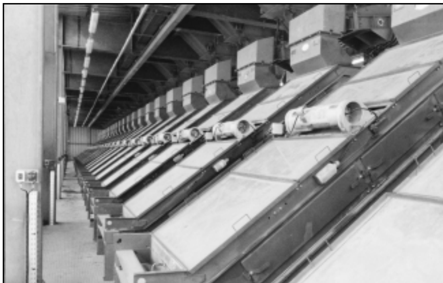
30/40 Mesh Sizing Screens