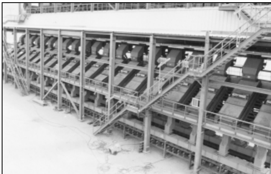
10 Mesh Sizing Screens